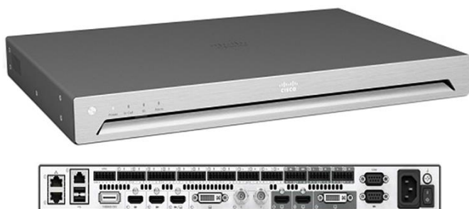
Figure 1. Cisco TelePresence SX80 Codec

Cisco offers three SX80 Integrator Packages to reduce the need for external equipment and the overall cost of enabling video in larger meeting rooms: