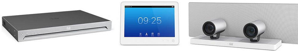
Figure 2. Cisco TelePresence SX80 Integrator Package with Touch 10 and SpeakerTrack 60